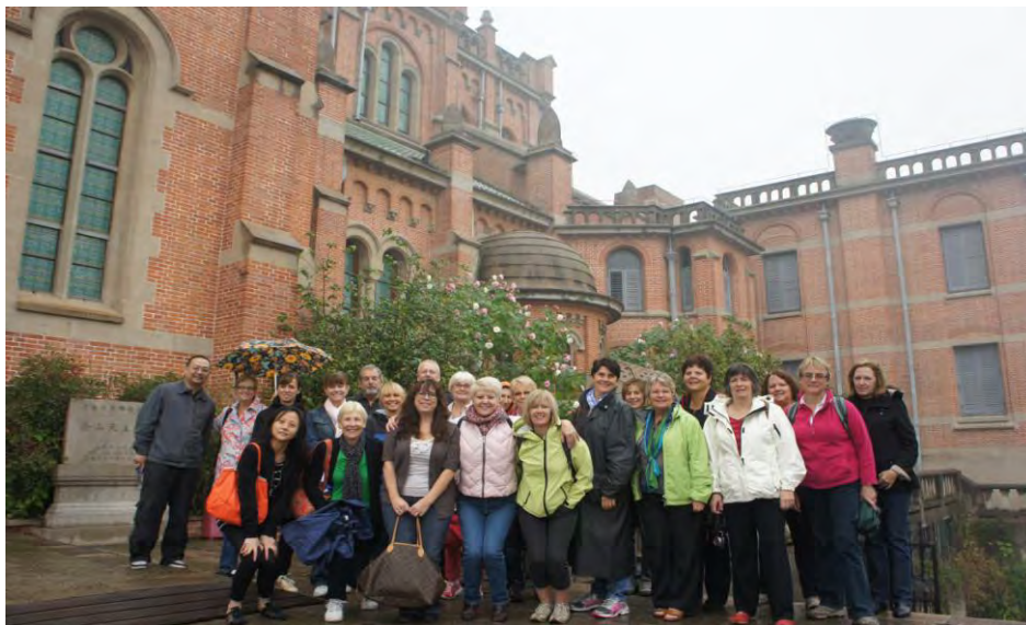
Day Trip to Sheshan