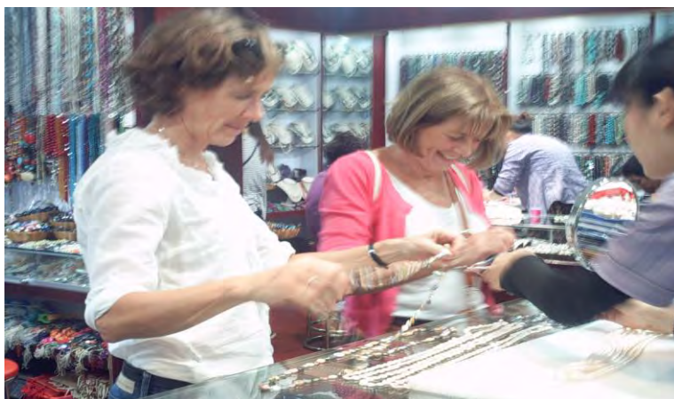
Shopping for Pearls At Yu Yuan Pearl Market